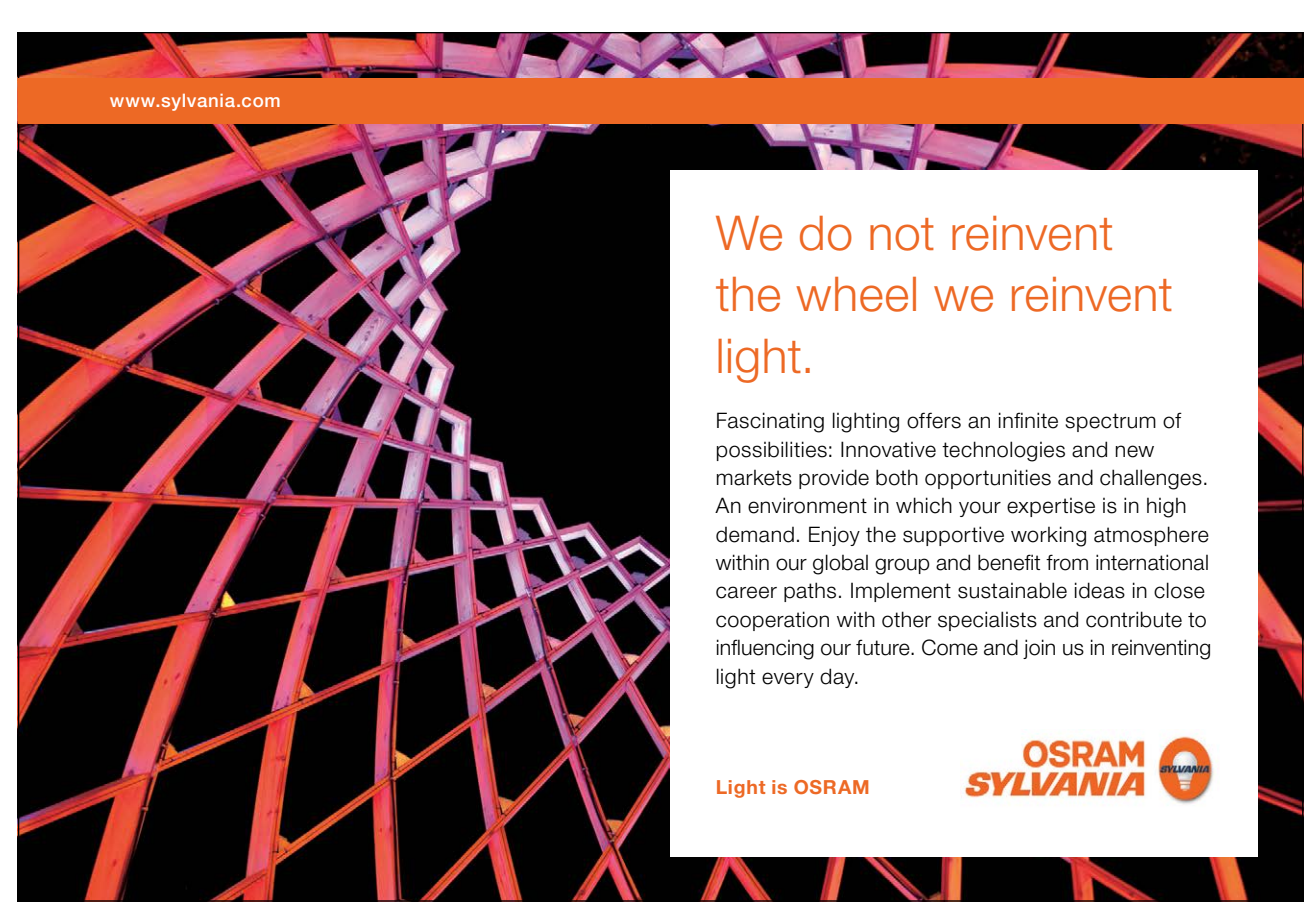
Download free eBooks at bookboon.com